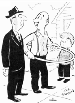
"Union meeting?...Gosh, I'd like to, Fred, but I don't have time!"

This cartoon was taken from the February, 1960 edition of the Carpenter magazine . However, it still holds true today. If members would attend their local meetings they would stay informed, be involved in business, and show their support for the Union and their fellow members.